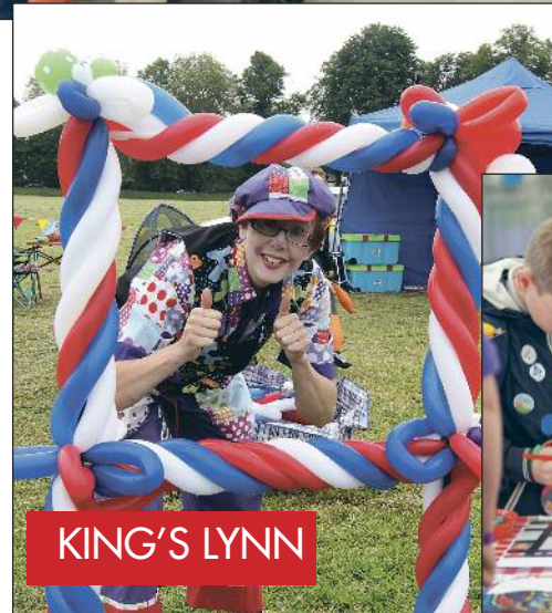
Celebrate will be showing the Christian church in action at The Forum in Norwich, above, the Walks in King's Lynn, left, and the Royal Norfolk Show, below.