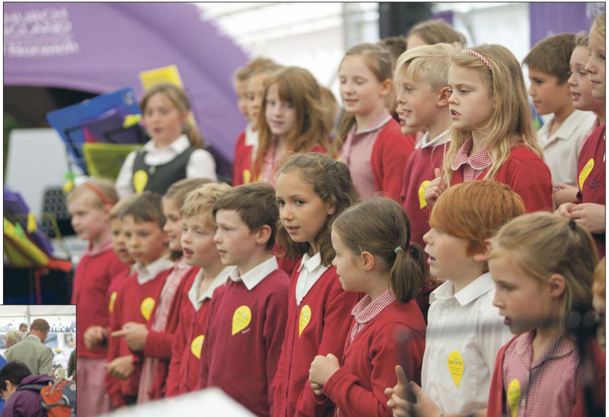
School choirs and a charities showcase will be part of the church in action marquee at the Royal Norfolk Show again this year.