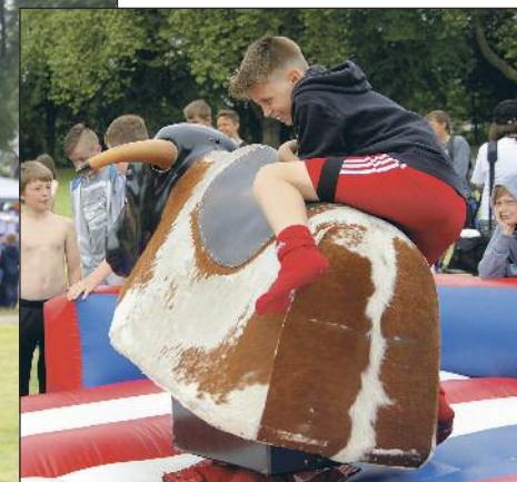
Celebrate King's Lynn is all set for The Walks in the town with the College of West Anglia, left, a bucking bronco ride, above, and Christian motorbike groups from around the country, bottom, all set to be there.