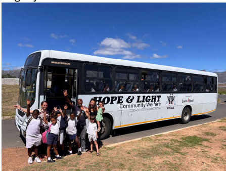
Visit from ZwickRoell