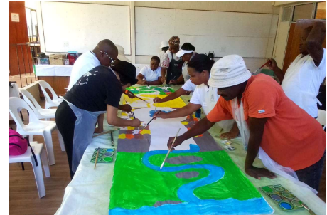
Staff workshop at Kirstenbosch

Please note that some contact details of the affiliated organisations have changed and you may receive an error message when writing an email. Feel free to contact us for assistance with the new contact details. Should you not have received your donation receipt from Helping Hands e.V. please send an email to info@helpinghandsev.org with your full name and address.